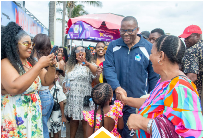
EThekweni Mayor Councillor Cyril Xaba engaged with holidaymakers on the Durban beachfront over the Easter holiday.

A WALKABOUT conducted by eThekweni Mayor Councillor Cyril Xaba on the beachfront over the Easter weekend revealed that the security measures implemented yielded positive results. Mayor Xaba also took the opportunity to engage with holidaymakers from South Africa and abroad during the walkabout.