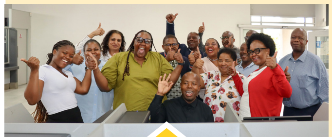
The City has launched the Digitally You job application portal, making job applications easier and more efficient.

"This platform strengthens trust, consolidates fragmented processes into one efficient platform, eliminates inefficiencies and demonstrates the City's commitment to a clean recruitment process that is based strictly on merit."